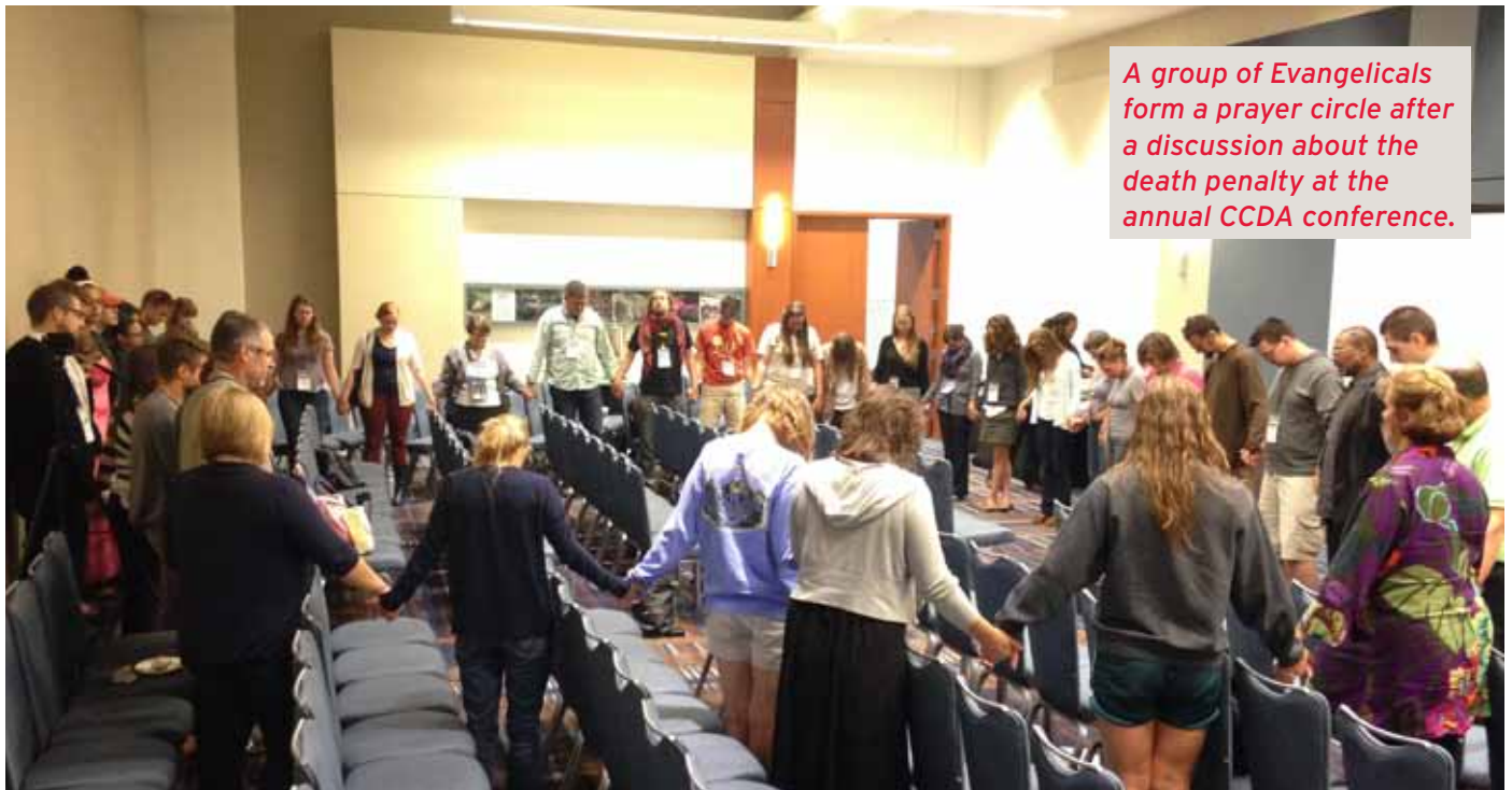
A group of Evangelicals form a prayer circle after a discussion about the death penalty at the annual CCDA conference.

It would have been difficult a decade ago to find many Evangelicals openly questioning the death penalty. Today, they are standing up in ever growing numbers.