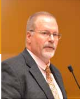
KirstenFrankly, Wikimedia Commons CC-BY-SA-4.0